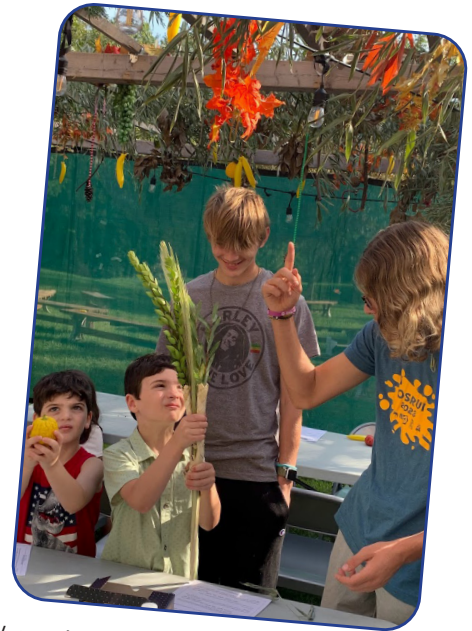
Learning about Sukkot in the Sukkah!