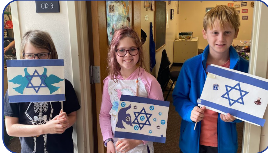
Celebrating Israel (above) and Art class (below)