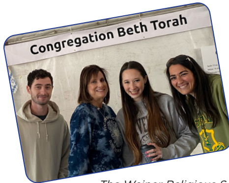
The Weiner Religious School booth at Jewish Culture Fest