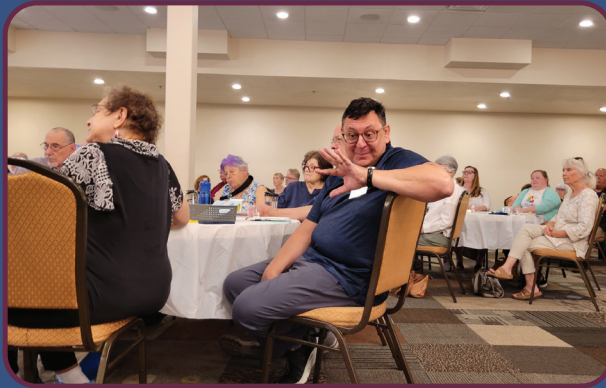
Good Faith Network End-of-Year Celebration, July 9 at the Islamic Center of Johnson County