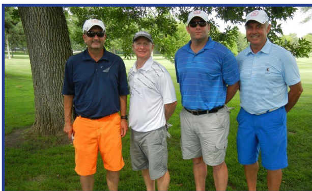
Frank Sterneck Golf Team 2015

Beth Torah is dedicated to creating an inclusive caring community by providing opportunities for lifelong learning and social justice involvement. The monies raised through a sponsorship of our CBT Golf Classic will help further our efforts to contribute to our community by supporting programs that benefit the Joel H. Winston Social Justice Fund , such as: Community Blood Center, BackSnack, reStart, Thanksgiving & Christmas at Pleasant Green Baptist Church and JFS area food pantries.